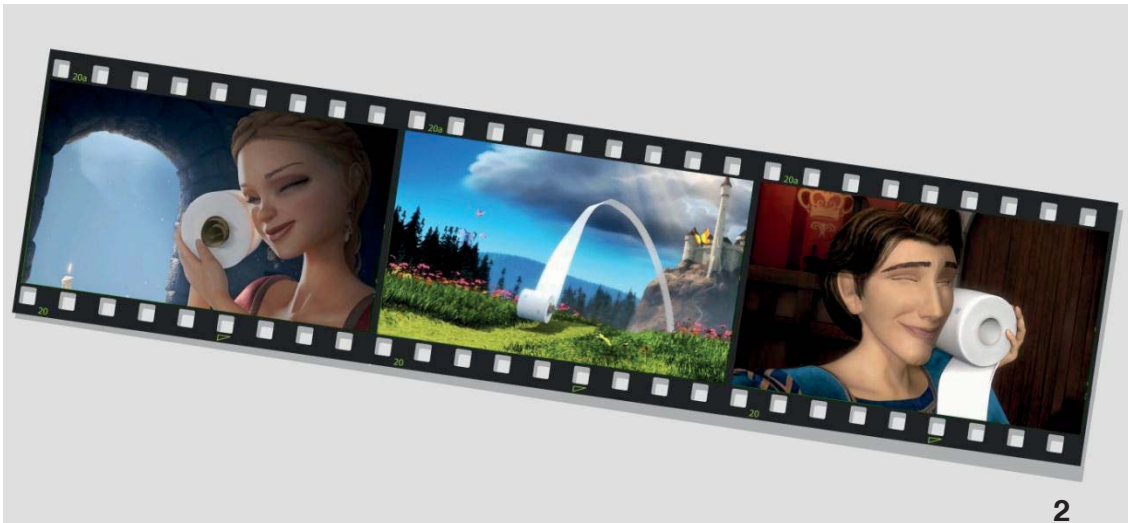
Fig.2. Frames from Regina advertising.